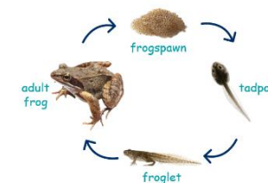
The life cycle of an amphibian (frog)