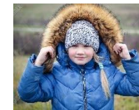
It is cold. We need a coat.