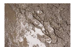
Mud is wet and soft.