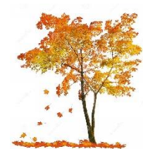
Leaves fall off some trees.