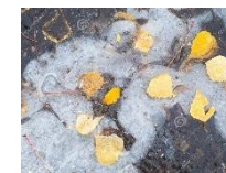
Ice on the ground.