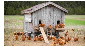
Chicken in a coop