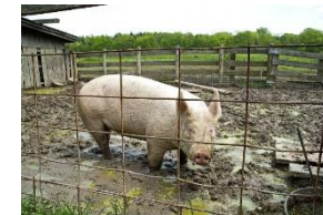
A pig in a sty