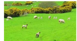
Sheep in a barn and in a field