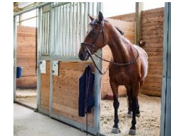
A horse in a stable