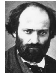
artist: Paul Cézanne