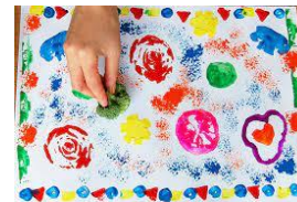
Examples of printing