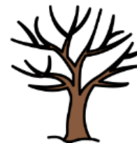
Leaves have fallen off some trees.