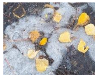
Ice on the ground.